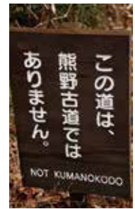
Not trail markers