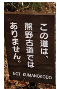
Not trail markers