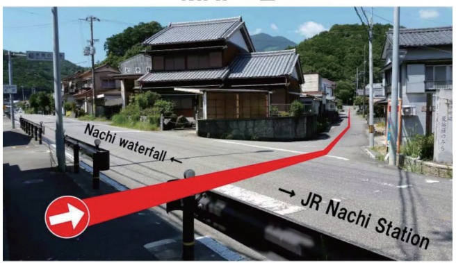
Cross the pedestrain crossing and proceed to the road to the residential area.